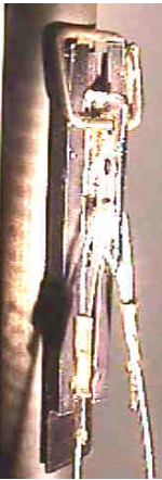
PW 56 Detachable hounds fitting Comprises a slide (& mast Insert) that Fixes to the Mast & a track insert To attach shrouds / jib £ 7.25

Adjustable height main sheet Post supplied 2 pieces of telescopic Tube plus acetal sheeting nipple. Also available moulded glass fibre Outer tube, for where corrosion is a problem £5.00